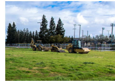
Good Sam, Branch Library, and Facilities buildings constructed.